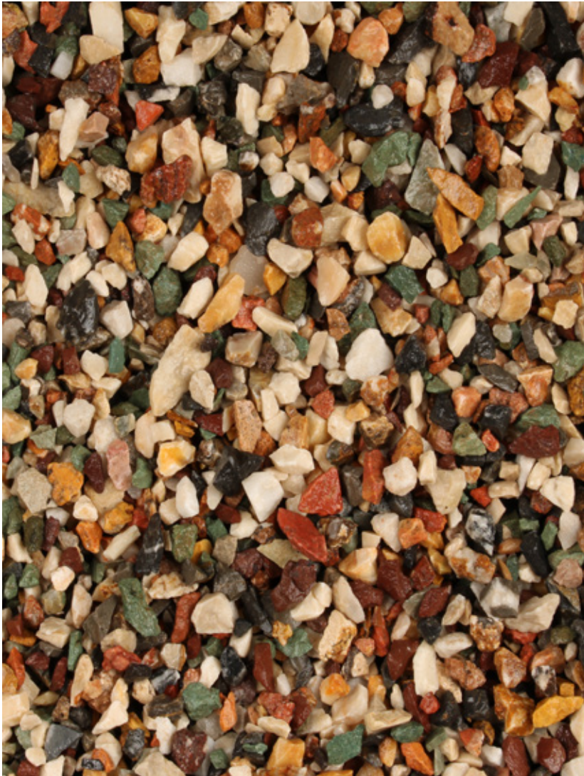
NUT MARBLE CHIPS