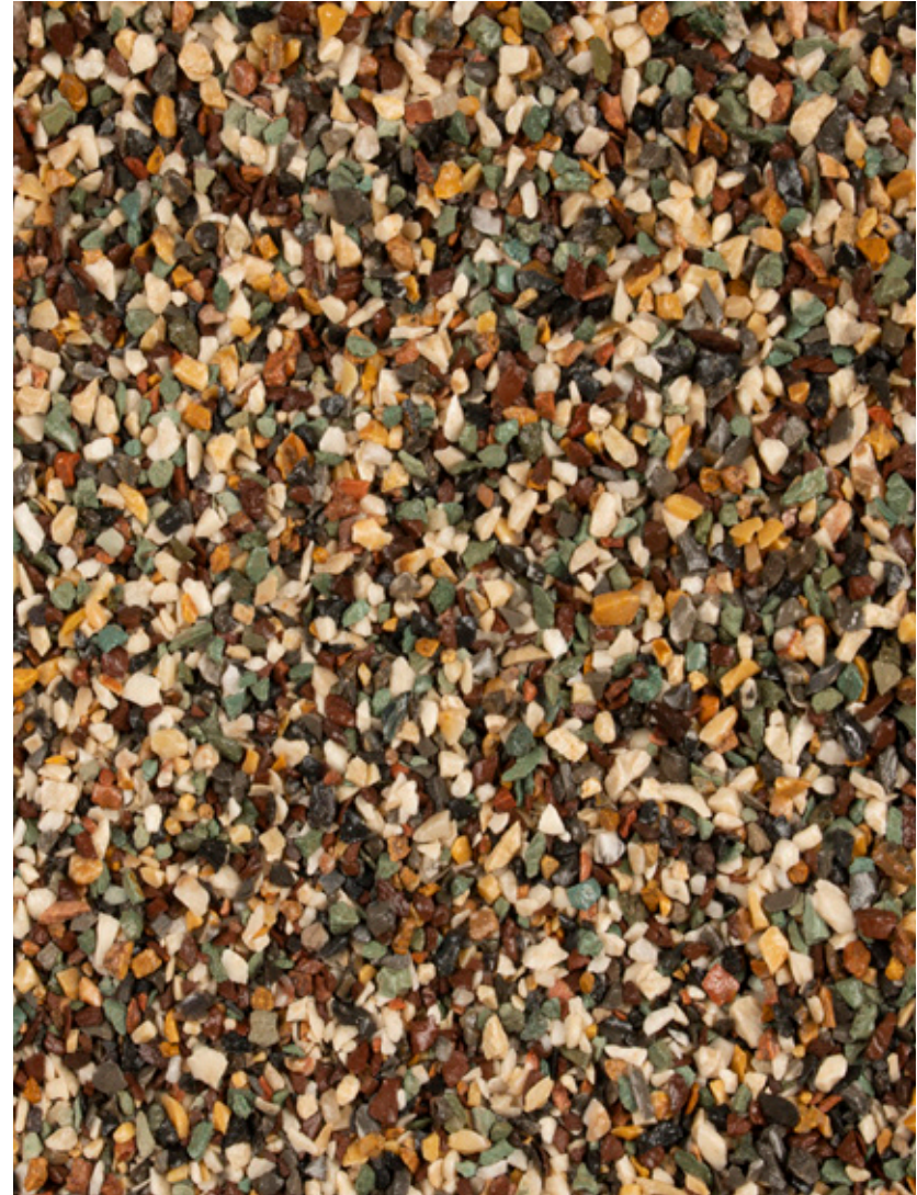
NUT MARBLE CHIPS