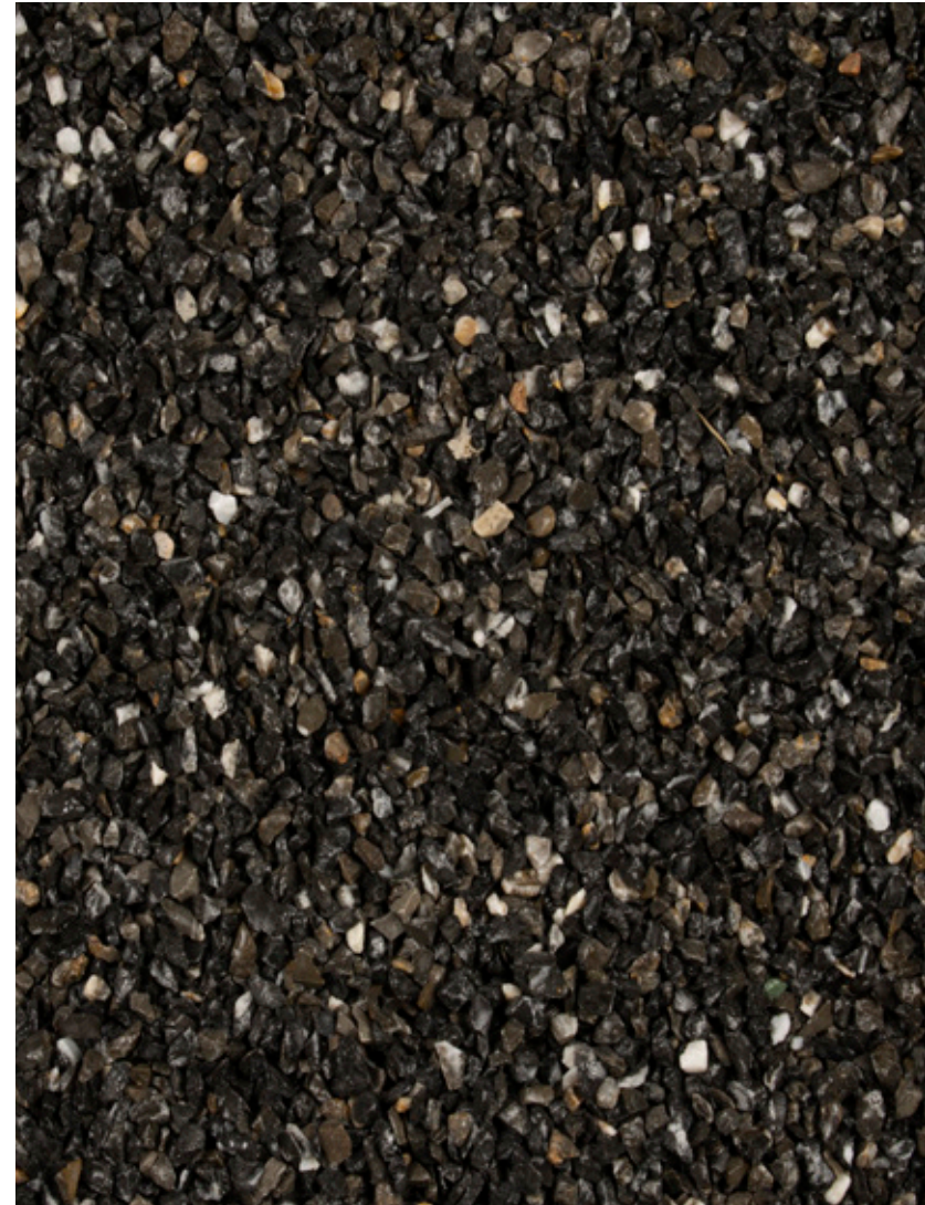
NERO BLACK MARBLE CHIPS