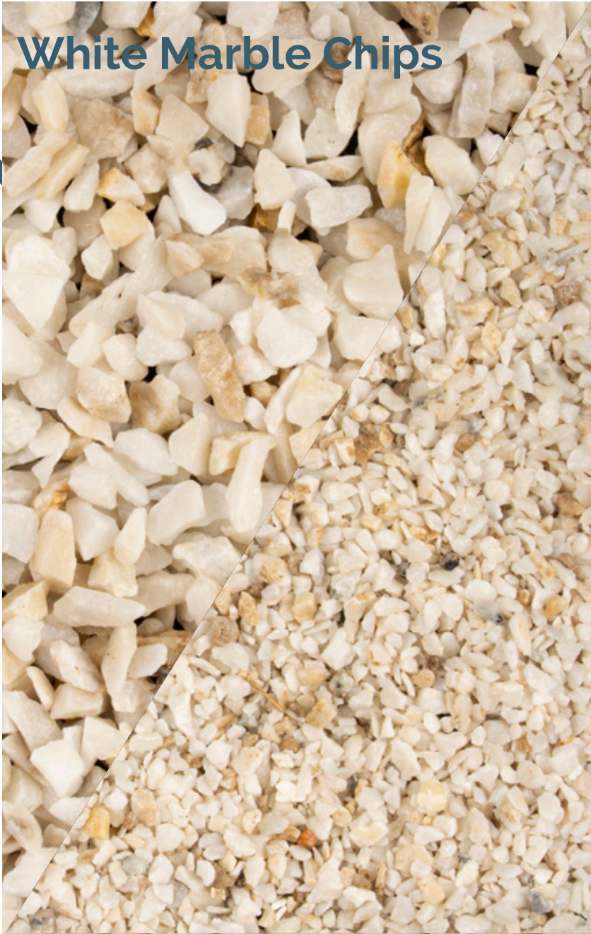
White Marble Chips