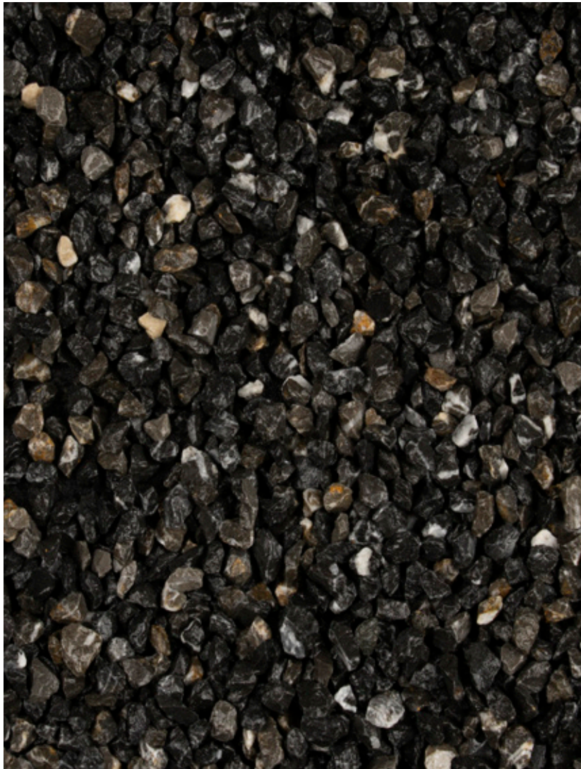
NERO BLACK MARBLE CHIPS