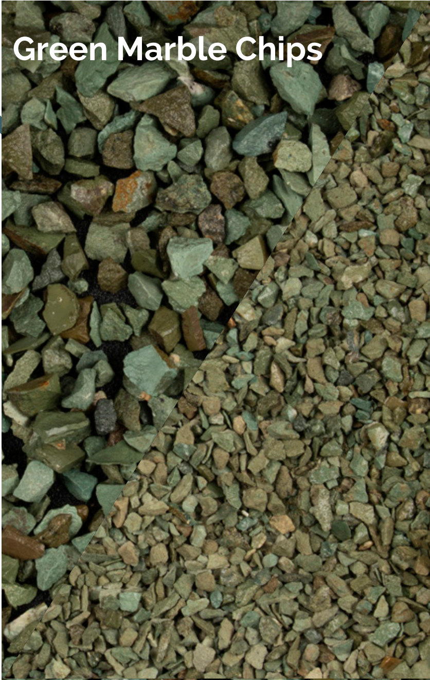
Green Marble Chips